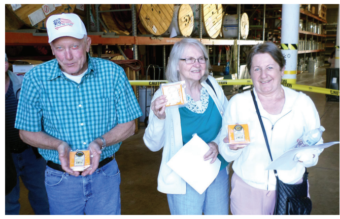
Members who attended the Dunn Energy Cooperative annual meeting on May 16 were given a pound of cheese from Ellsworth Cooperative Creamery – Menomonie as a parting gift.